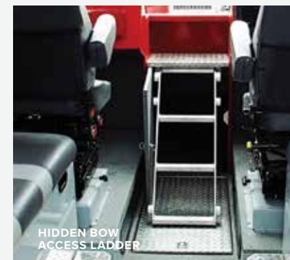
HIDDEN BOW ACCESS LADDER